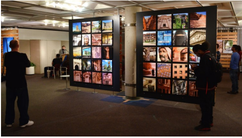
"Red Rock and Rust Belt" Exhibition

We are excited to announce that the Alfred Berkowitz Gallery officially became a department of the Mardigian